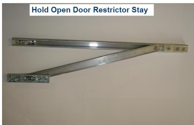
Hold Open Door Restrictor Stay

Note: Should additional friction be required simply tighten the pozi screw in the friction pad.